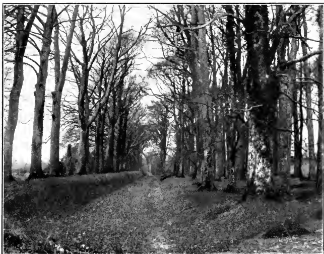
THE GROVE AT WOODBROOKE